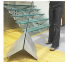
Tilt & Roll Feature Relocate with ease