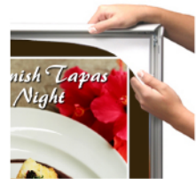
Poster Slides into Place