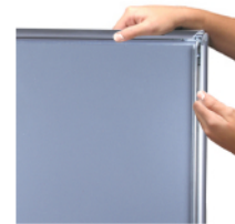
Frame Edges Snaps Open

The anti-glare UV overlay protects and ensures a flat presentation.